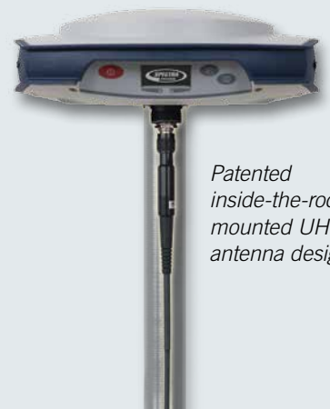
Patented inside-the-rod mounted UHF antenna design